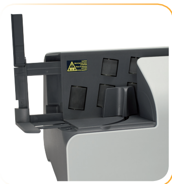
Easy-to-use support arm extends to hold large envelopes